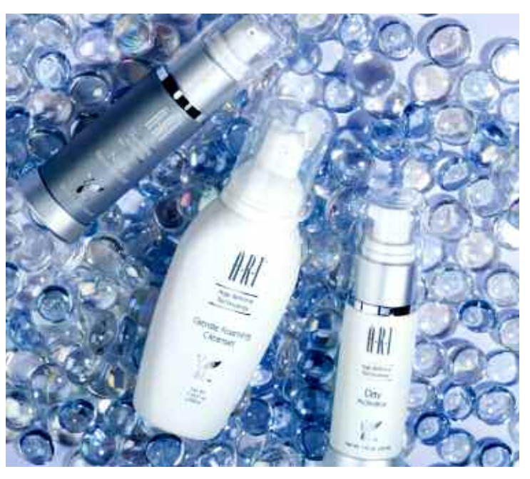
Once again, Young Living has taken the finest ingredients and combined them with the latest skin care technology to create a system that enhances your skin's natural ability to rebuild DNA and restore youthful looking skin.

Age Refining Technology is the Art and Science of Skin Care.